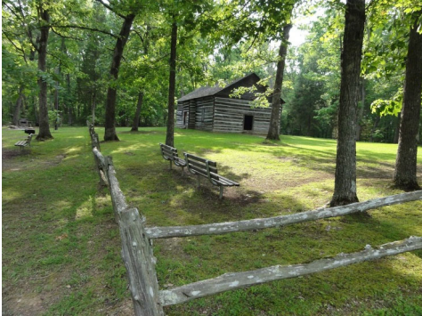
Old Mulkey Meeting House

The Butler County Homemakers will offer three "Day Trip" tours this year. These tours will be educational and fun. Homemakers will be able to learn more about our area, other members, and have fun. You must RSVP in order to participate. These tours are open to any homemaker member. If someone wants to join Butler County Homemaker's, dues are only $10.