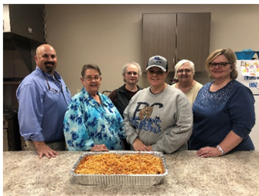
Butler County Homemakers provided pasta meals for the less fortunate in 2023.

Did you know that you can help as a Homemaker? You can donate dry spaghetti, canned spaghetti sauce, large cans of green beans, or large aluminum pans and lids for use with the meals prepared. You can also come to the Extension Office and help prepare the pasta meal. Once the food has been prepared, it is delivered to "The Kitchen" where other volunteers prepare plates for delivery or to be consumed on site.